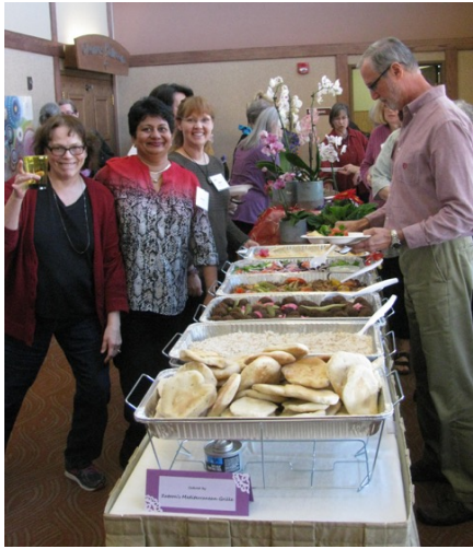
Mediterranean Dinner Friday