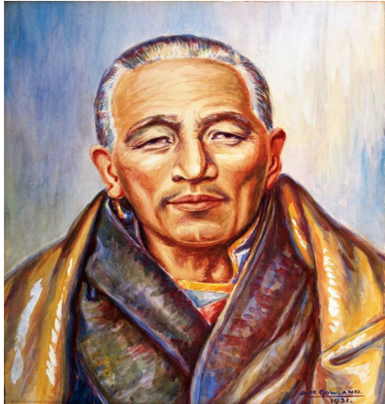
The Tibetan Master, Djwhal Khul (D.K.)